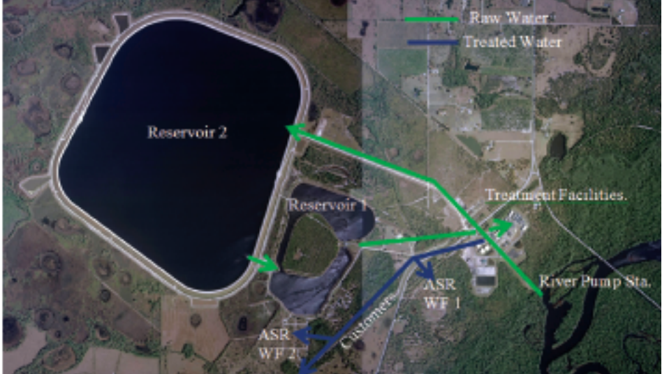
Figure 4. Wet Season Operation