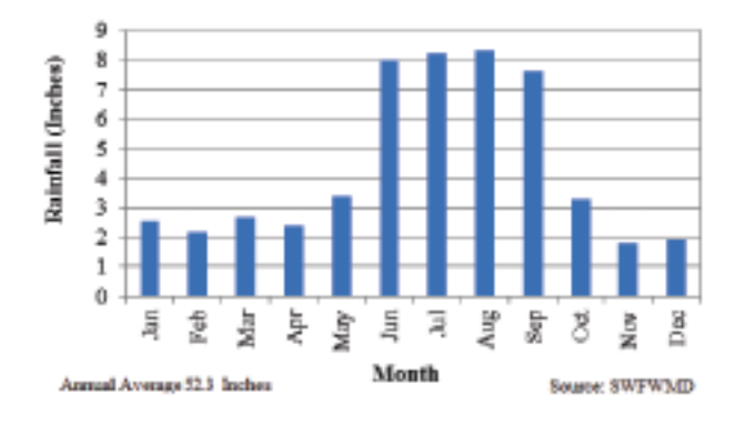
Figure 1. Southwest Florida Average Monthly Rainfall

Two storage options employed by the Peace River Manasota Regional Water Supply Authority (Authority) at the Peace River facility in DeSoto County are working examples of the large-volume storage needed to effectively utilize southwest Florida rivers. These include an off-stream reservoir system and aquifer storage and recovery (ASR). The systems are utilized conjunctively at the Peace River facility to support drinking water supply operations. Each system has advantages and disadvantages, and unique operational requirements, regulatory issues, and costs that need to be considered. The Authority's experience with each system is presented here for