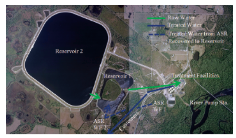
Figure 5. Dry Season Operation